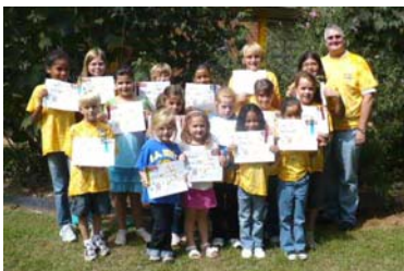
Congratulations September Star Students!!!