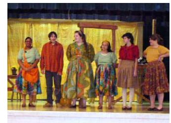
CSU performs Senora Tortuga at E.A. White

"One Call Now" is a parent notification service to keep students safe and parents/guardians informed. It can be used to announce school events, attendance, and emergency school closings. ***Please send in your current phone number and preferred email address so that you can be notified of what is happening at E. A. White when parents/guardians need to be informed.