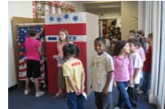
Second graders vote in our mock election.