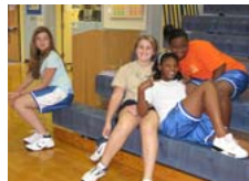
Girls' basketball teammates relax before a game.