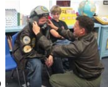
An eighth grader learns what it takes to fly an F-15.