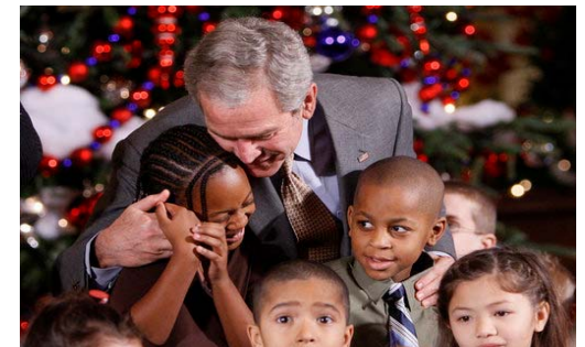
Dahlgren students enjoy a hug from President Bush at a December 2008 White House Christmas reception.