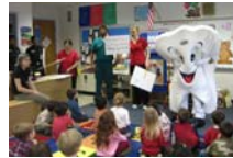
Kindergarten and pre-K greet a special guest.