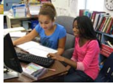
Middle schoolers collaborate on a project.