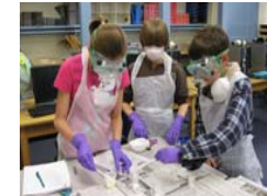
Students love science lab.