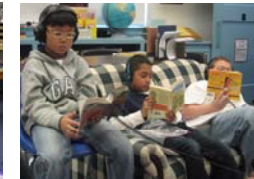
Students appreciate class reading time.