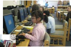
Our information center gets lots of use.