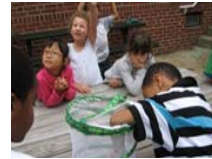
First graders study migration habits of monarch butterflies.