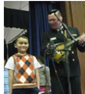
The Navy Band receives some student advice.