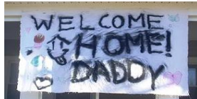
Our staff is specially trained in the unique needs of military families.