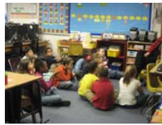
Students gather for a lesson.